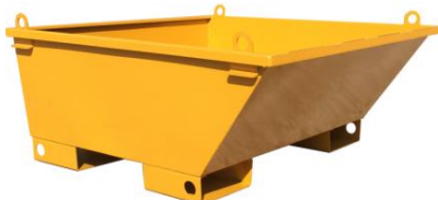
PALBAC 500 L