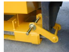
Safety locking system