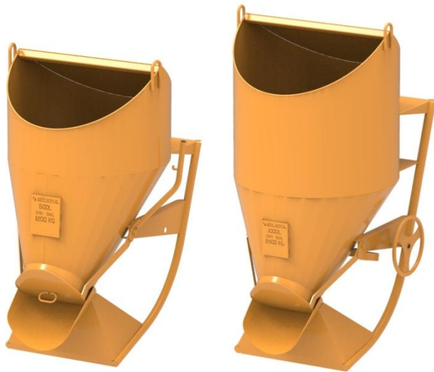
Model 142C B 500L