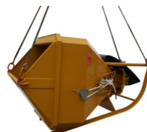
Horizontal handling when empty to ease the loading and the unloading on the trucks

Presentation: This column skip is designed to enable concrete to be poured into narrow shuttering or columns. It is a rollover type skip whereby the skip sits in the horizontal position for filling and reverts to the vertical when in use.