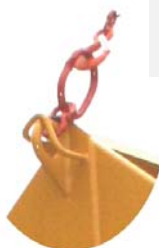
Zoom on a lifting point (European patent)