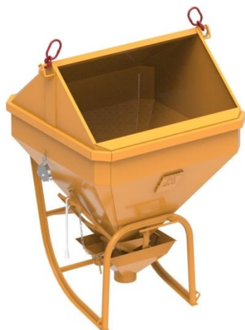
TIC PF 1500 L