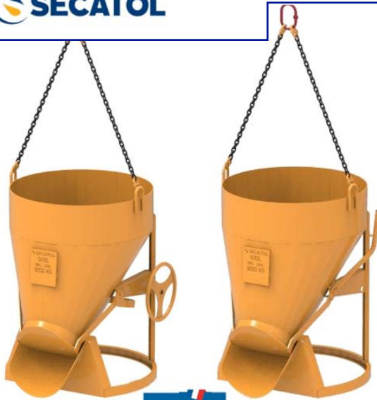
Model 142 E 500L VO