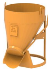
Model 142 B 500L