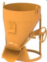
Model 142 B 500L VO